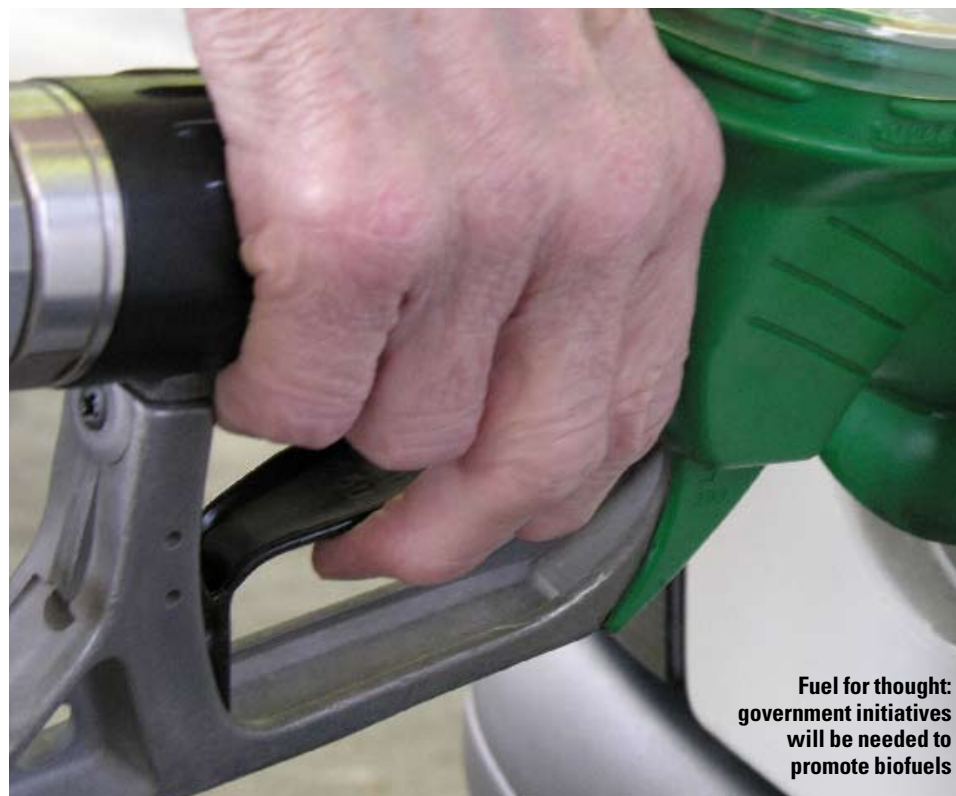
Fuel for thought: government initiatives will be needed to promote biofuels